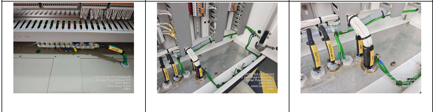
INDIVIDUAL EARTHING CONNECTIONS COMPLETED FOR I/O CABLES TO RTU EARTH BAR INDIVIDUAL EARTHING CONNECTIONS COMPLETED FOR I/O CABLES TO EARTH STUD AT RCB PANEL INDIVIDUAL EARTHING CONNECTIONS COMPLETED FOR I/O CABLES TO EARTH STUD AT RCB PANEL SECOND PICTURE (IF ANY)