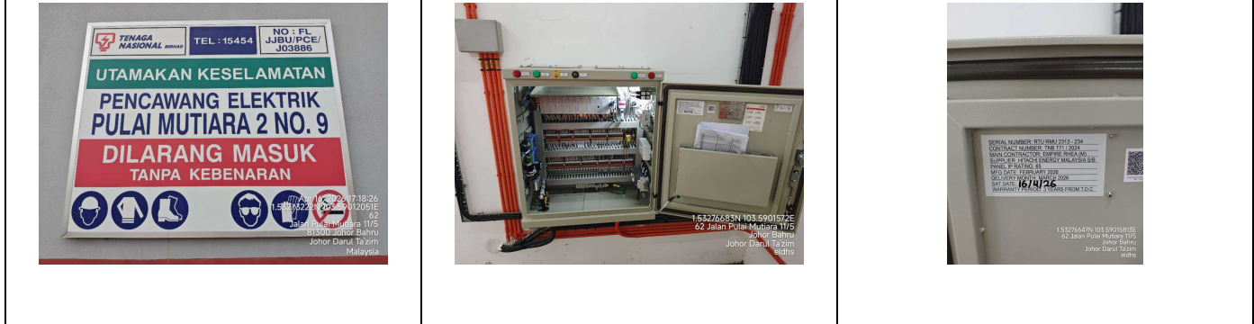
OVERALL PICTURE OF SUBSTATION OUTER WALL (WITH SUBSTATION NAME) RTU AFTER INSTALLATION (WITH INSIDE PICTURE) RTU WARRANTY STICKER (COMPLETE WITH SAT DATE)