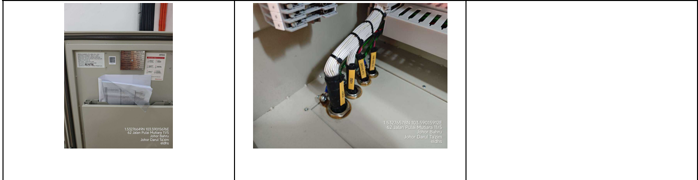
OVERALL PICTURE OF MASTERSHEET INSIDE RTU PANEL CABLES GLAND INSIDE RTU PANEL CABLES GLAND INSIDE RTU PANEL SECOND PIC (IF ANY)