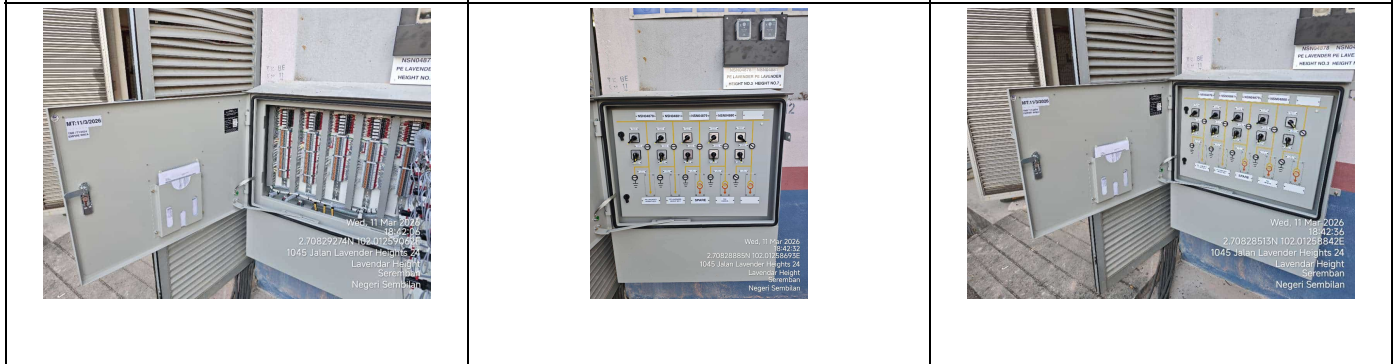
SAMPLE OF COMPLETED MULTI-CORE CABLE TERMINATION (INSIDE RCB) SECOND PICTURE (IF ANY) SAMPLE OVERVIEW OF RCB'S SINGLE LINE DIAGRAM (COMPLETE WITH FEEDER NUMBERS) SAMPLE OVERVIEW OF RCB'S SINGLE LINE DIAGRAM (COMPLETE WITH FEEDER NUMBERS) SECOND PICTURE (IF ANY)