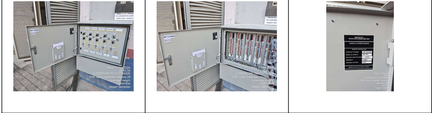
OVERALL PICTURE OF WIRING LIST INSIDE RCB PANEL OVERALL PICTURE OF RCB SCHEMATIC DIAGRAM INSIDE RCB PANEL RCB (COMPLETE WARRANTY STICKER)