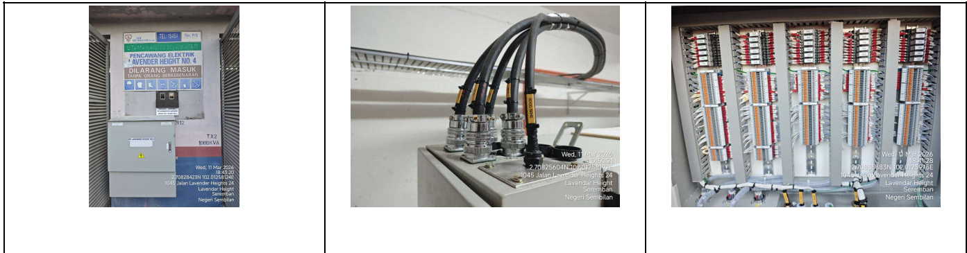
OVERALL PICTURE OF SUBSTATION OUTER WALL (WITH SUBSTATION NAME) SAMPLE OF COMPLETED MULTI-CORE CABLE TERMINATION (AT SWITCHGEAR'S SIDE) SAMPLE OF COMPLETED MULTI-CORE CABLE TERMINATION (INSIDE RCB)